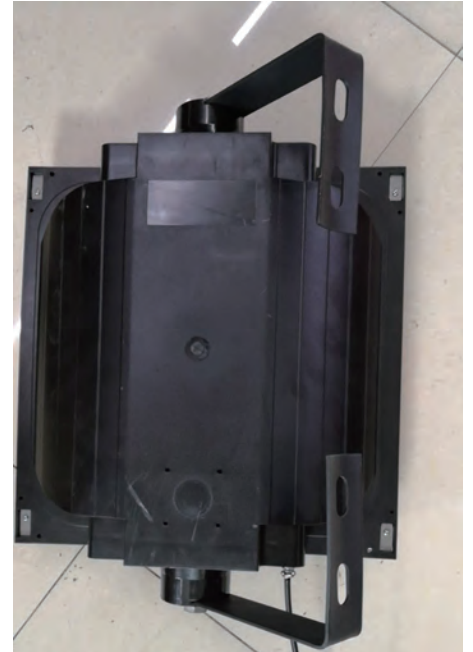
↑ back view