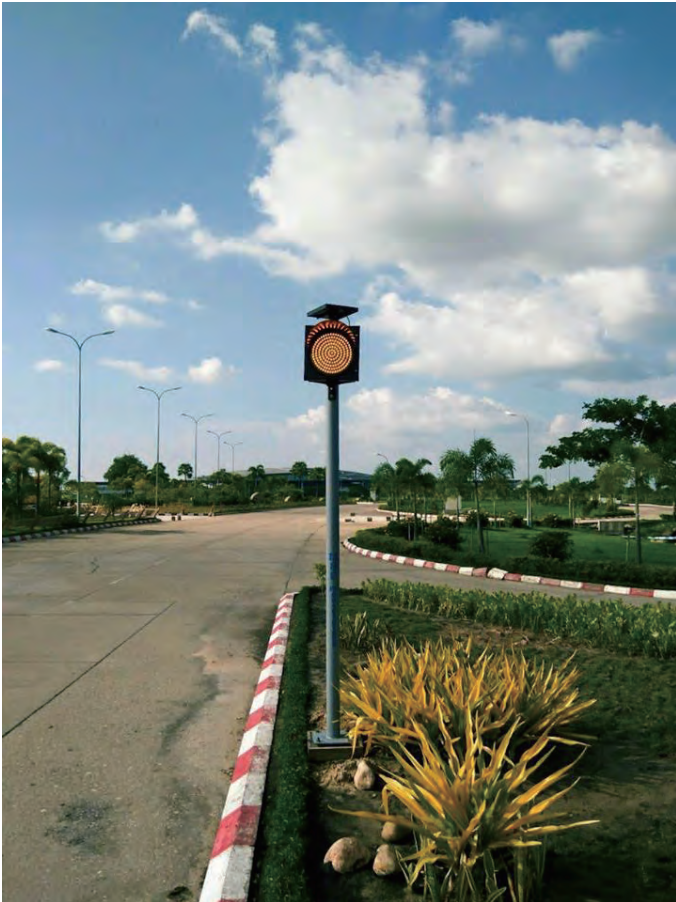
↑ Single type I