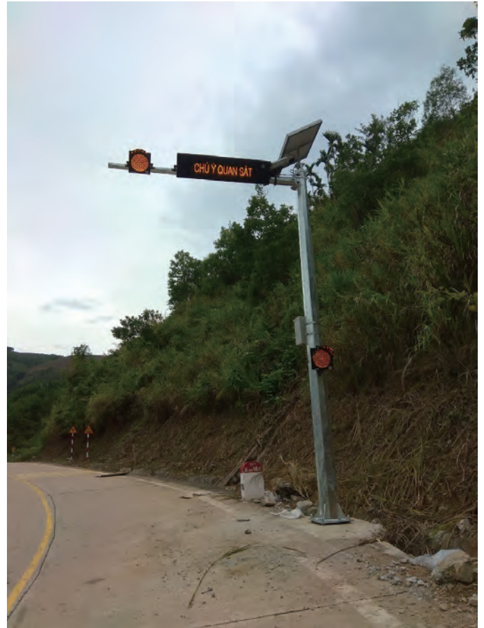
↑ Single type II

(2pcs light share 1pcs solar panel and 1pcs battery)