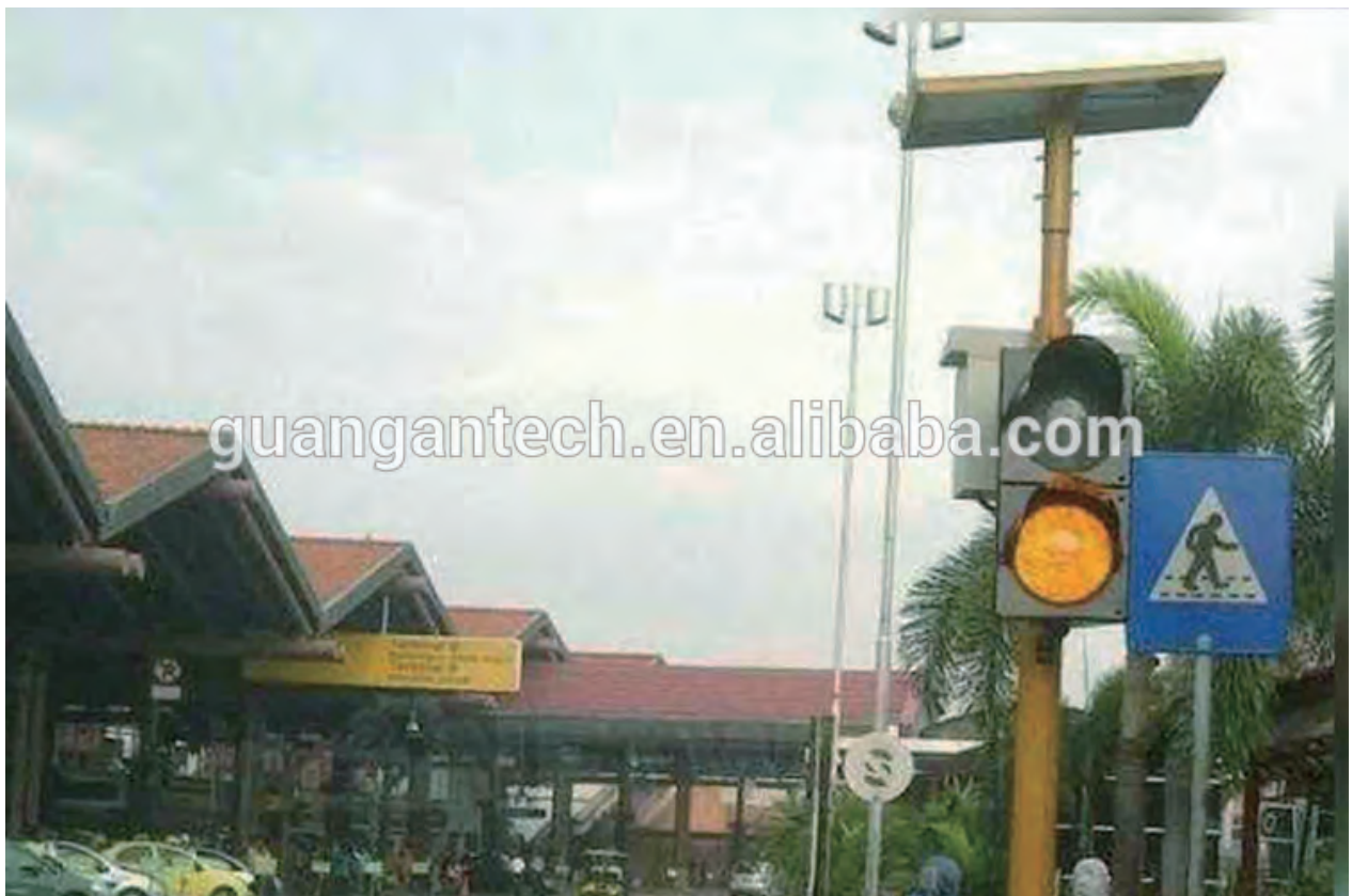
↑ double type

(2pcs light share 1pcs solar panel and 1pcs battery)