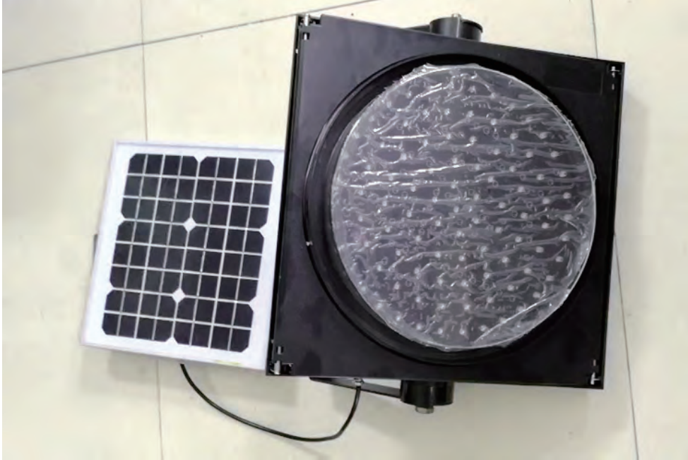
↑ front view